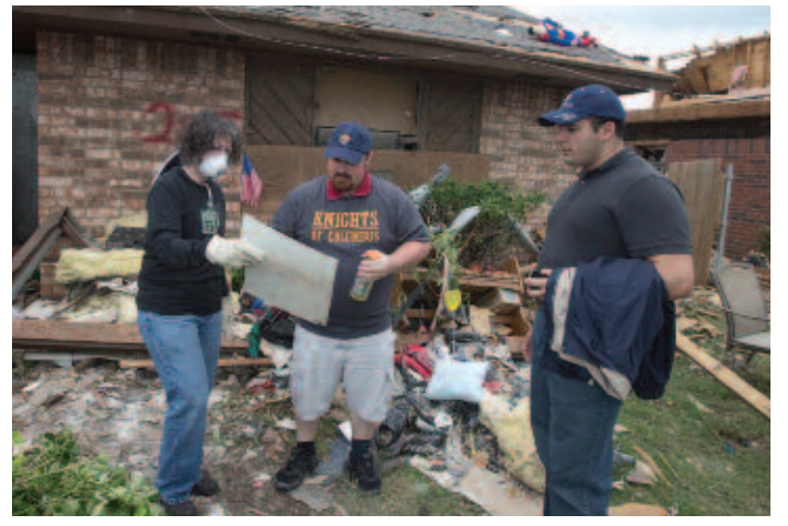
Better exposure, as well as good cropping, in a closer action shot.