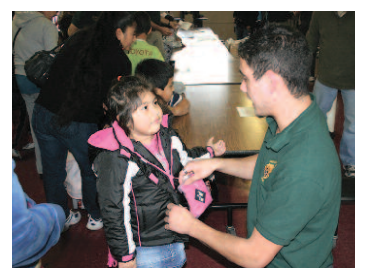
This photo has much less K of C/council branding on the knight's shirt and in the background, leaving it unclear what organization he is representing or what the event is about.