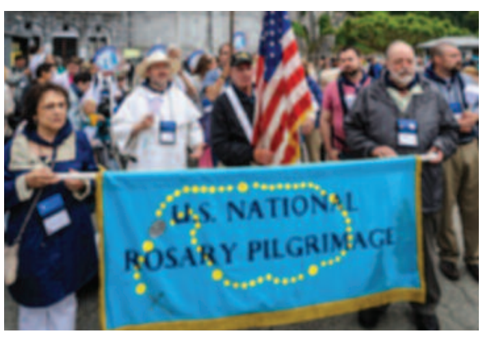
The photo on the left shows great signage/branding and a focused, established shot with good composition. The right photo is blurry, with no K of C branding/signage and poor composition.