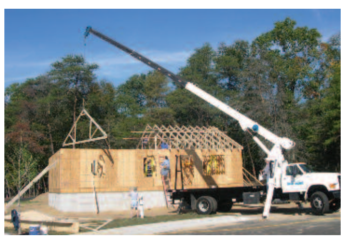
Because this photo is farther away, we can't see details or K of C branding.