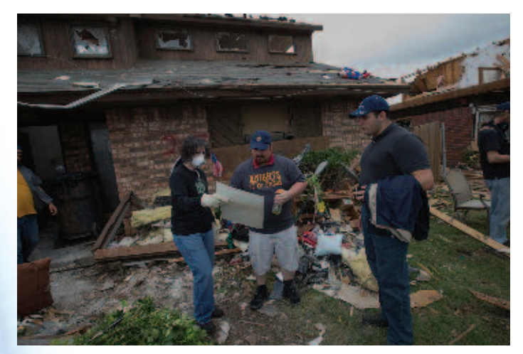
Dark exposure and poor cropping (men cut off on both the left and right) are shown here.