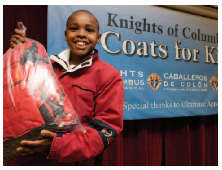
This better photo shows clear signage and branding on the background banner, identifying what the event is and that it's a Knights of Columbus-sponsored event.